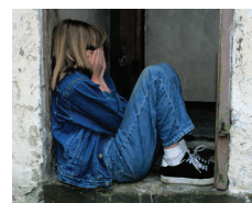
Reduced Child Abuse and Neglect