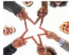
Improved Coordination and Referral for Other Community Services