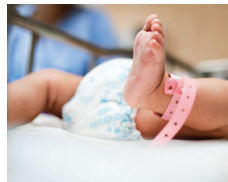
Improved Birth Outcomes

Research has proven the benefits of home visiting, including: