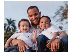
Improved Parenting Practices