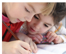
Improved Kindergarten Readiness