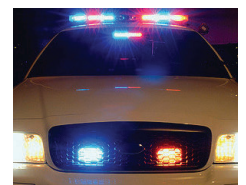
Reduced Crime and Domestic Violence