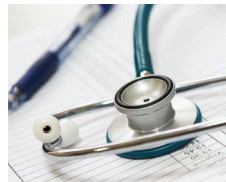
Early Detection of Health Issues and Developmental Delays