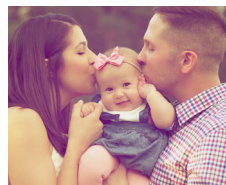
Improved Family Self-sufficiency