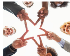
Improved Coordination and Referral for Other Community Services