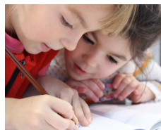
Improved Kindergarten Readiness