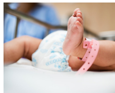
Improved Birth Outcomes

Research has proven the benefits of home visiting, including: